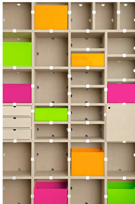
STOCUBO glows: special edition of the shelving system with fluorescent elements by Regine Schumann.